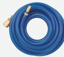
High pressure hoses